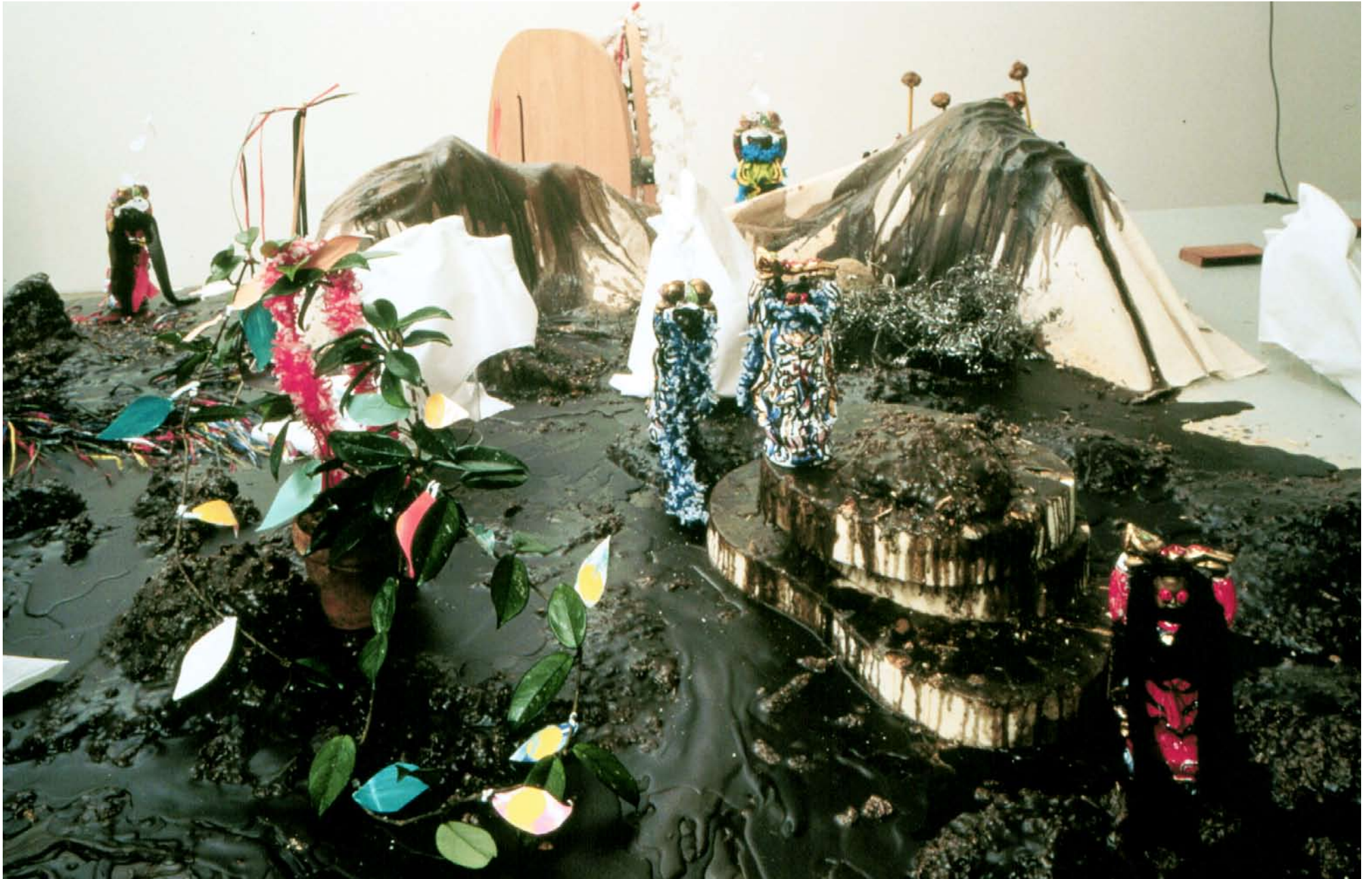
BLOWTORCH THE HOOD, CROSSDRESS TRESPASS

A Wild Zone is a refuge within the organised structure of society. It is not a marginal place, but an experimental area, which develops parallel to the controlled and established relations of everyday life. For the exhibition at Witte de With, Tee is inspired by hip-hop and motor race culture. In her installation she turns stereotypical macho signs into colourful objects and rapid images. The absurdity of the combination of objects and the enlargement of familiar images make Tee's installation an alienating experience. She specifically addresses her interest in the conditioning and manipulation of human behaviour and the effect subcultures have on this.