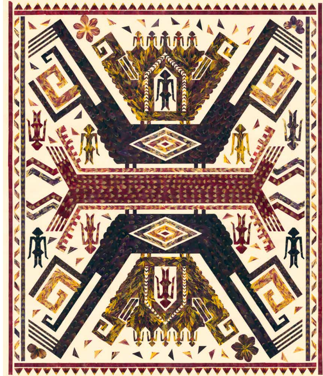
TAMPAN TULIP 04/06

TAMPAN SHIP OF SOULS Tulip petals collage on paper 190 x 170 cm