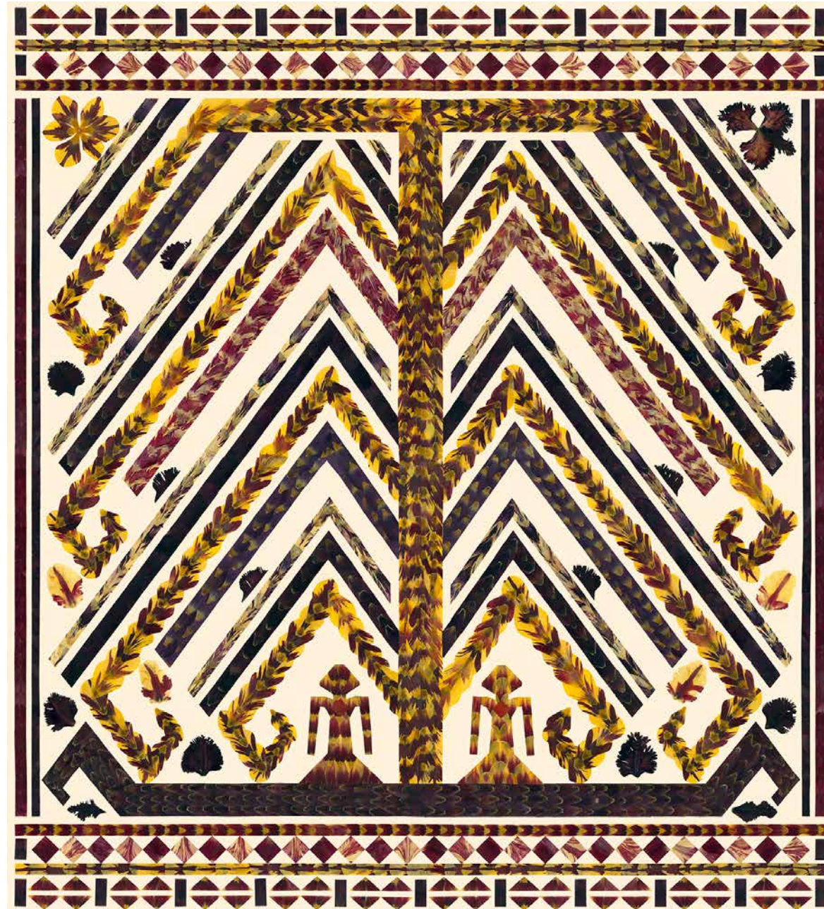
TAMPAN TULIP 05/06

TAMPAN TREE OF LIFE Tulip petals collage on paper 165 x 150 cm