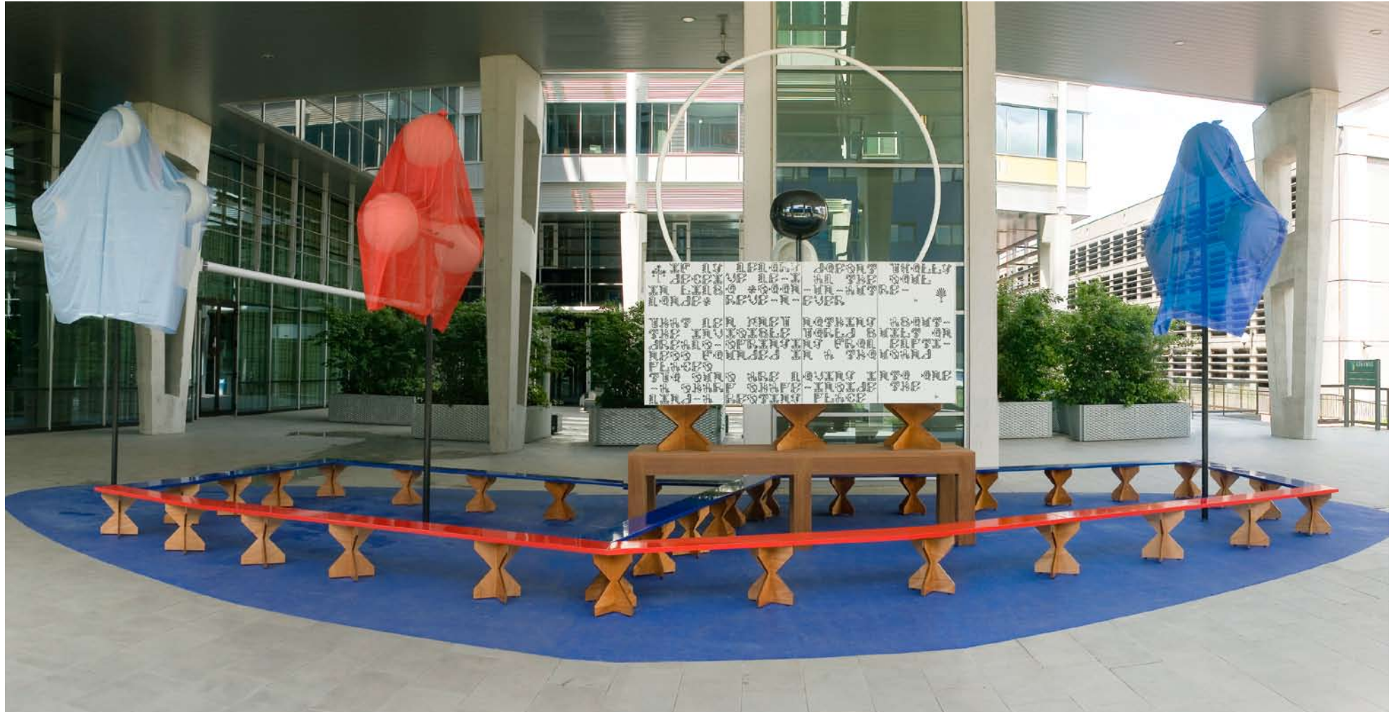
THE STATE OF LIMBO / THE TEARGARDEN