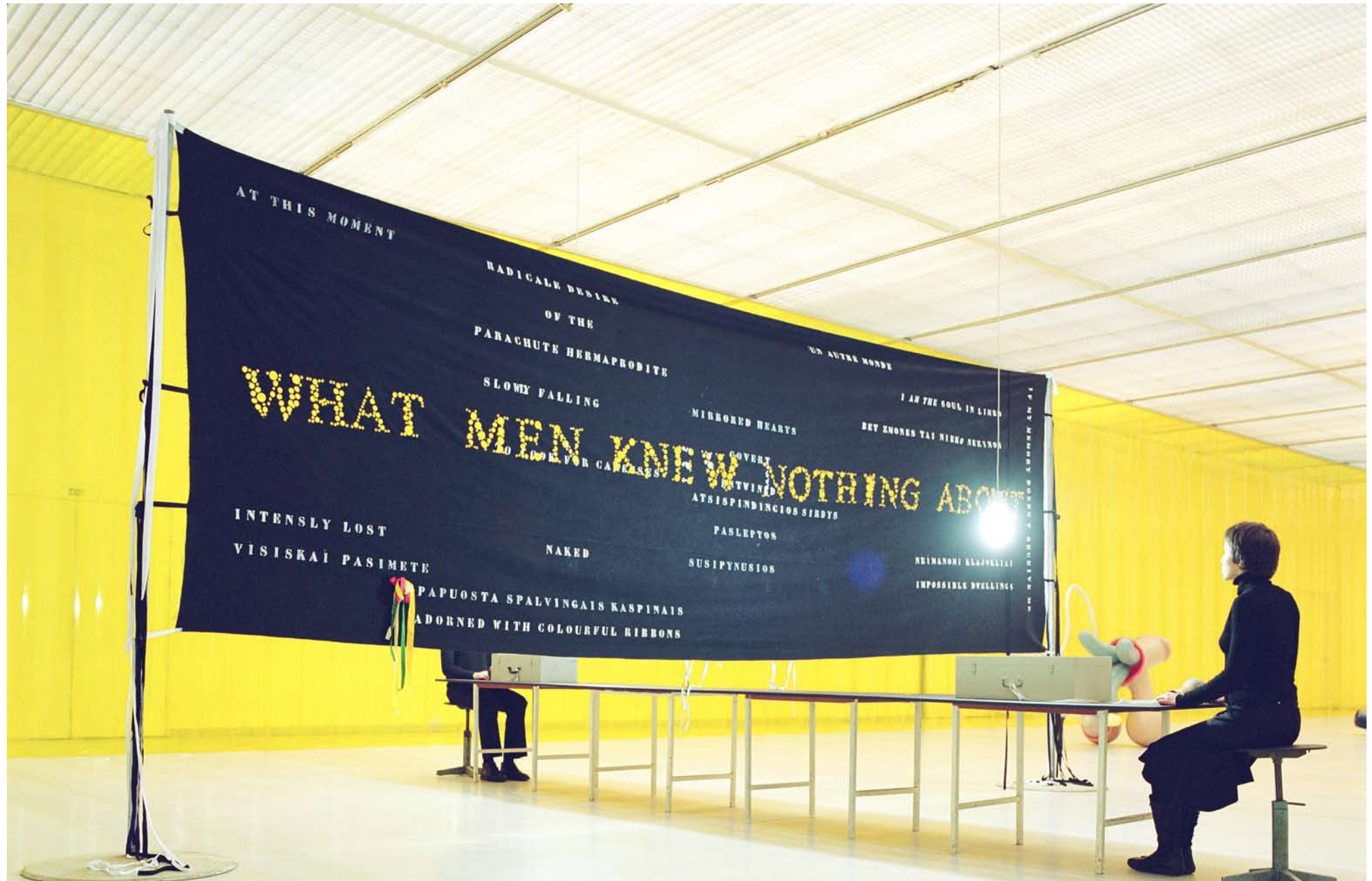
WHAT MEN KNEW NOTHING ABOUT