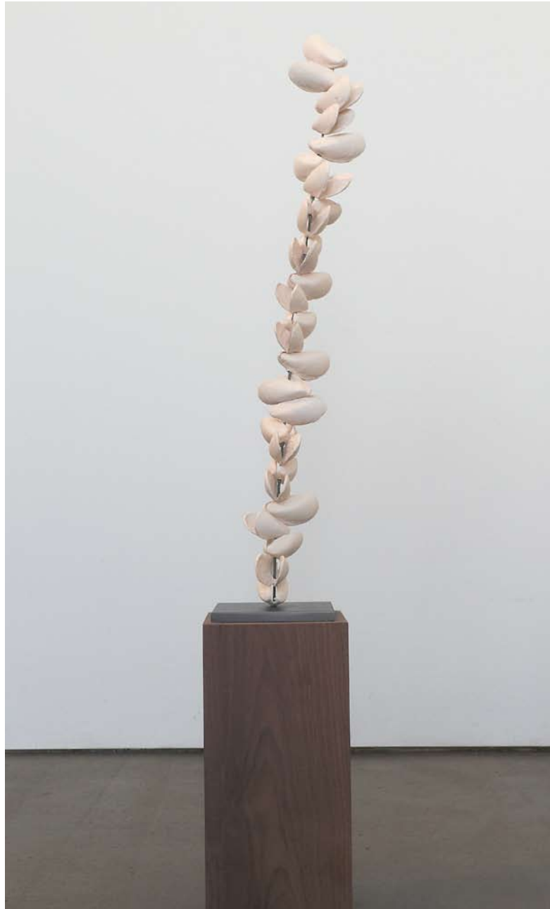
SOUTH OF THE BORDER 04/05

1 SILENCE Porcelain moules, metal base, wooden base 15 x 74 x 15 cm (metal base and moules) 18 x 36 x 18 cm (wooden base)