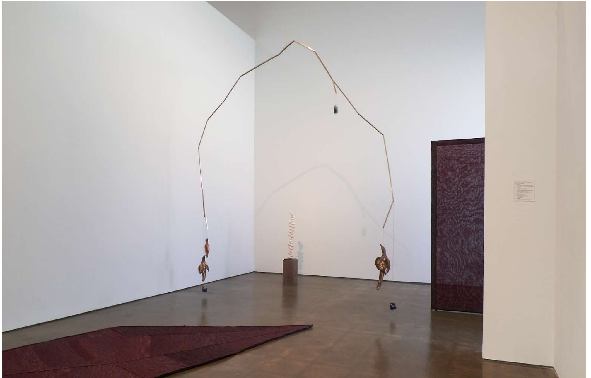
SOUTH OF THE BORDER

This residency was generously supported by the FBKVB.