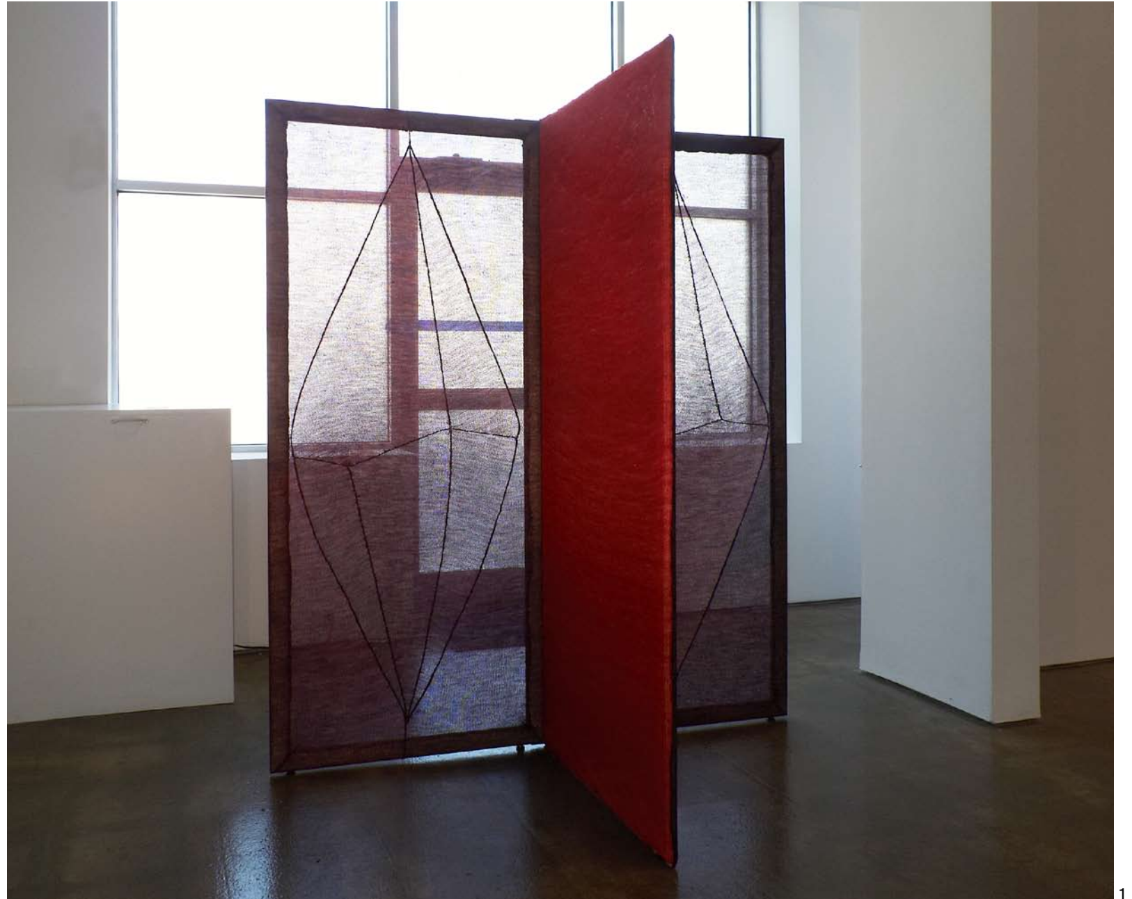
SOUTH OF THE BORDER 05/05

1 SOUTH OF THE BORDER / ROOM DIVIDER Hand-dyed lace wool, 3 wooden frames Colours: duchess, oxblood, scarlet 1.66 x 1.91 x 0.83 m